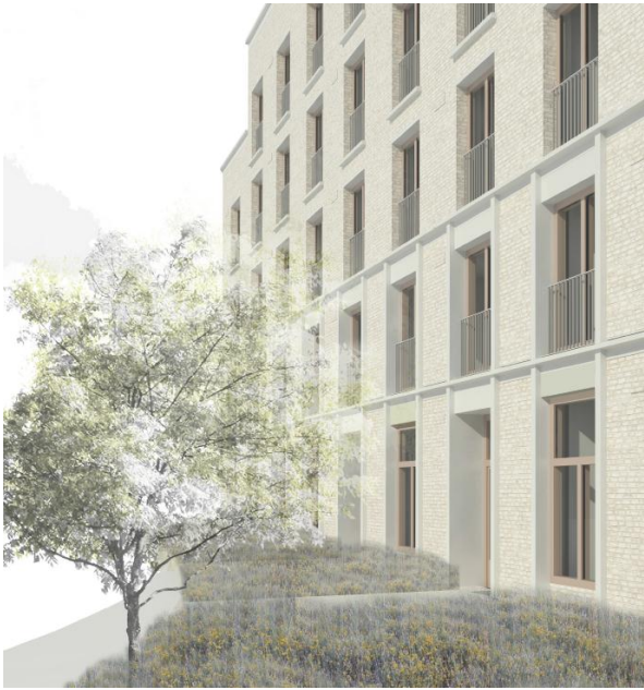
Frontages to the Primary Street (above) and Ridgeway (right)